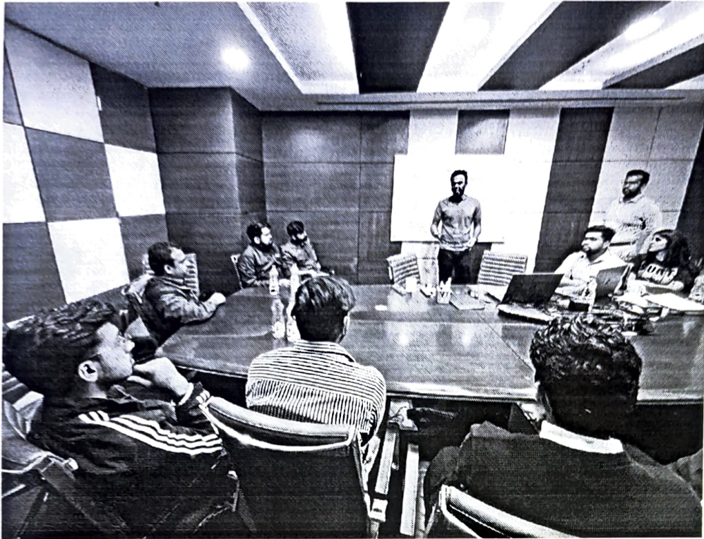
Students at Sweco India Pvt. Limited, BPTP Park Central