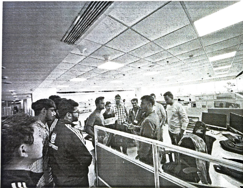
Site Head sharing his experiences with Students

Faculty of Engineering & Technology SGT University Gurgaon (Haryana)